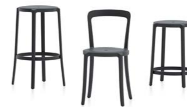
ON & ON by BARBER & OSGERBY

Made from recycled polypropylene and wood fiber.