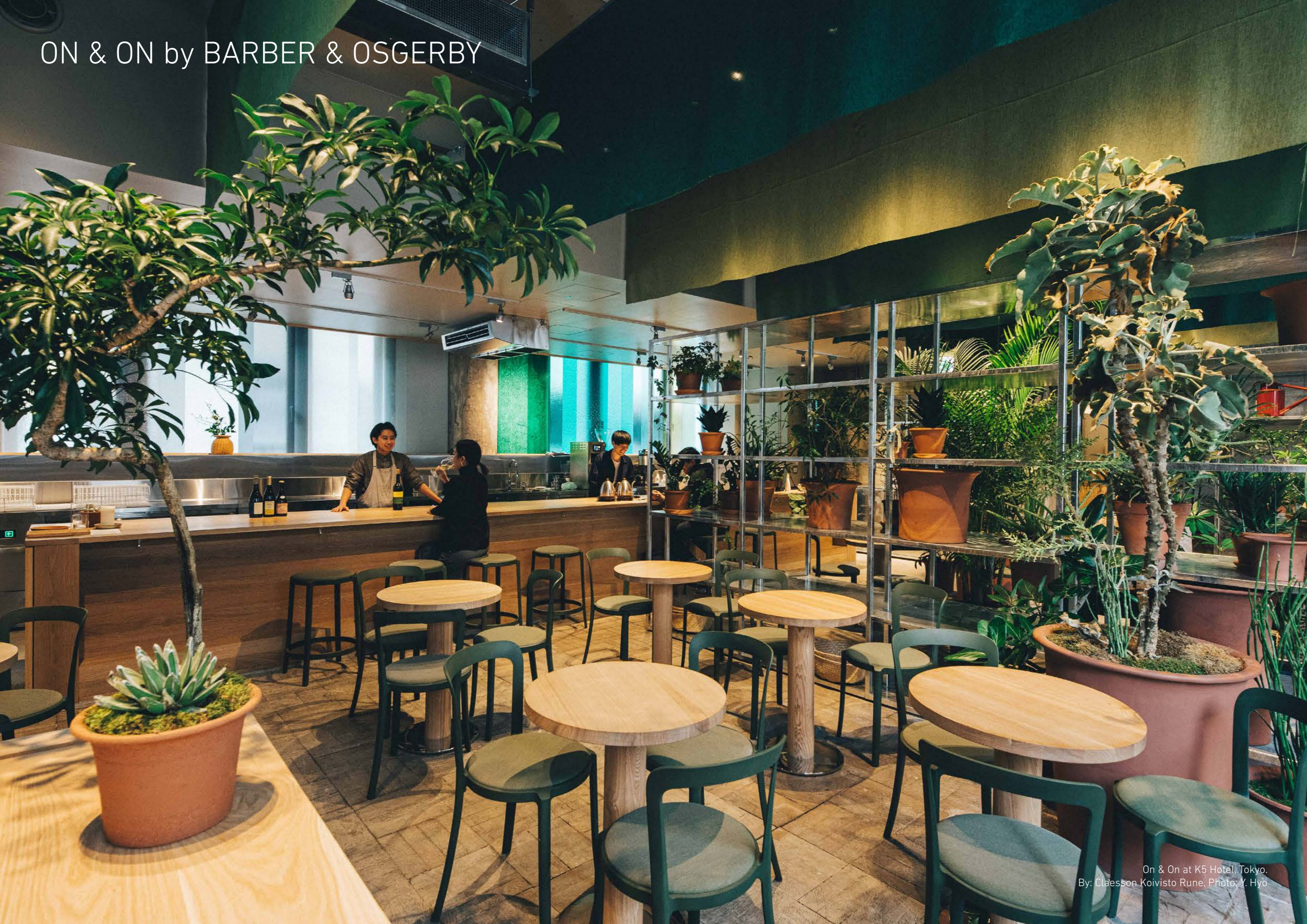
On & On at K5 Hotel, Tokyo. By: Claesson Koivisto Rune