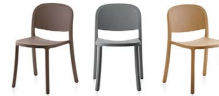
1 INCH RECLAIMED by JASPER MORRISON

Made from recycled polypropylene and wood fiber.