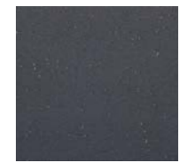
DARK GRAY WPP