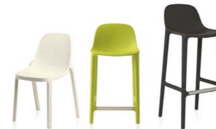
BROOM by PHILIPPE STARCK

Made from recycled polypropylene and wood fiber.